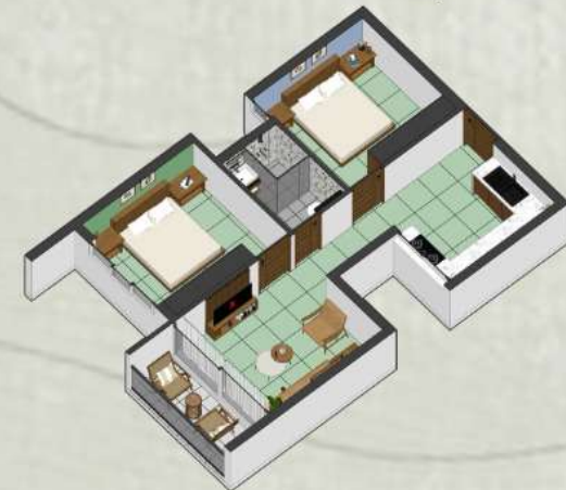
2 BHK Apartment