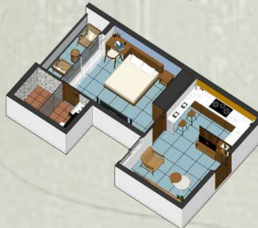
1 BHK Apartment